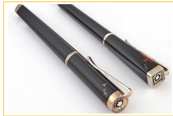
Montblanc Writers Edition 2004 Franz Kafta Set of Pens