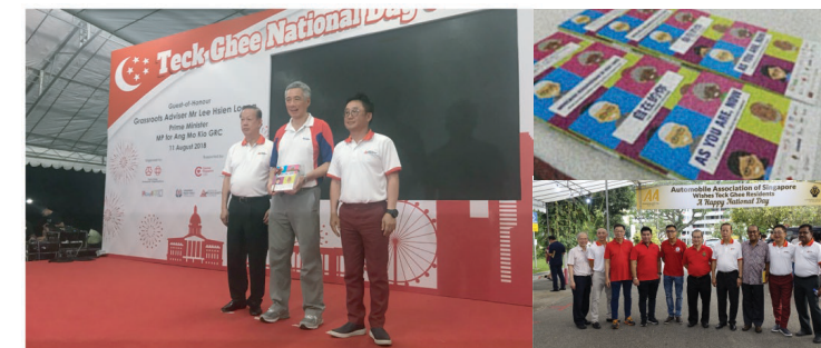
Official Launch of RHT Rajan Menon Foundation's Eldercare Guidebook by Prime Minister Lee Hsien Loong on 11 August 2018

The Foundation supports 4 main causes i.e. education, disadvantaged groups, environment & sustainability, and the arts and sports. In addition to its Ageing Right Project (an ongoing initiative on eldercare), the Foundation also spearheads an initiative on sustainability, which is called Greening ASEAN: Initiatives & Leadership (GAIL).