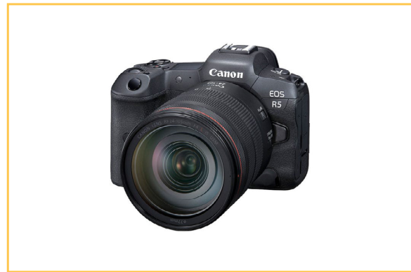
CANON EOS R5 mirrorless camera with full kit worth $7,989