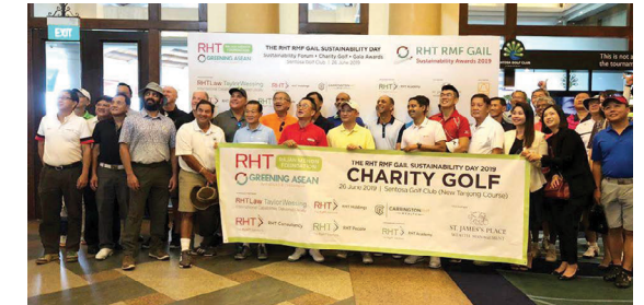
RHT Rajan Menon Foundation Charity Golf

RHT Rajan Menon Foundation Ltd ("Foundation") is a Singapore registered charity as well as a grant-making philanthropic organisation approved by the Inland Revenue Authority of Singapore. It is the corporate social responsibility vehicle of RHTLaw Asia LLP and the RHT Group of Companies. The Foundation enables philanthropic activities to be carried out in a structured and more sustainable manner. Set up in 2015, the Foundation seeks to establish, inspire and encourage a philanthropic culture among the corporate and legal fraternity of giving back to the community in a focused, hands-on and meaningful manner.