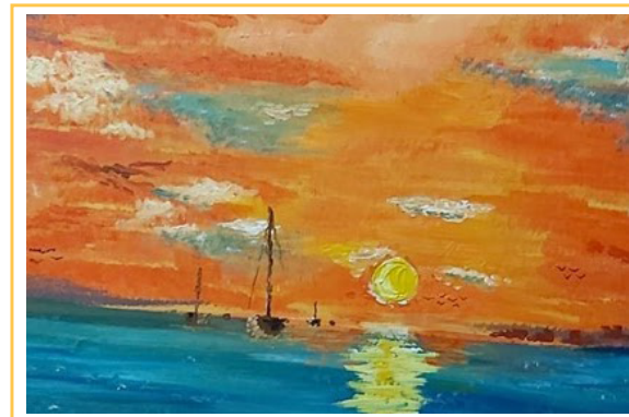
Painting - Follow The Sun