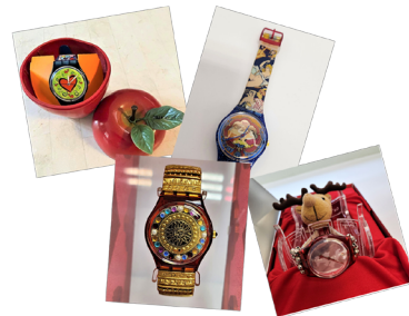
LIMITED EDITION SWATCH WATCHES

For more details and information on the various auction items (both silent and live), scan the QR code or visit