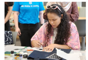
Upcycled Items by DAS Alumnus