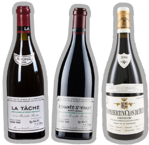
EXQUISITE WINES WORTH UP TO $15,000!

and help us raise funds for individuals with dyslexia!