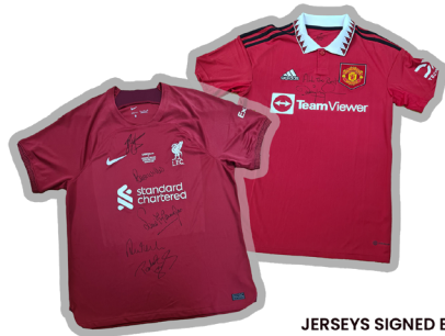
JERSEYS SIGNED BY PROFESSIONAL FOOTBALLERS