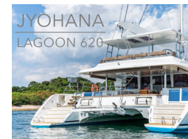
Luxury Yacht Experience for 4 hours (20 pax)