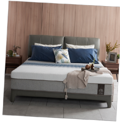
PREMIUM FLOW MATTRESS WORTH $6,488