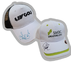
CAPS SIGNED BY PROFESSIONAL GOLFERS