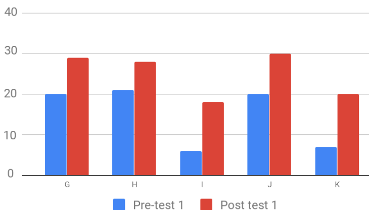
Year 1 Test 1