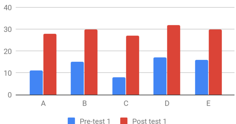
Year 3 Test 1

Students made significant improvement from pre-test to post-test at the \alpha = .05 level (one-tailed).